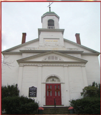
First Parish Federated Church